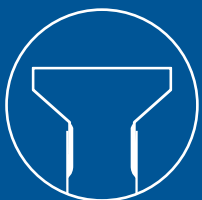
Our specialised sealants seal waste pipes and wastes